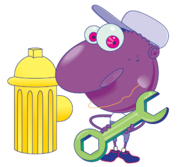
Figure This! The water control valve on the cover of a fire hydrant has five sides of equal length and five angles of equal measure. Many common household wrenches will not turn these valves. Why not?

Hint: Think about an ordinary household wrench. Most wrenches have two parallel sides; that is, the sides are everywhere the same distance apart.